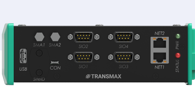
FP.VT-04 (standard 4-port option) FP positioned vertically in the field