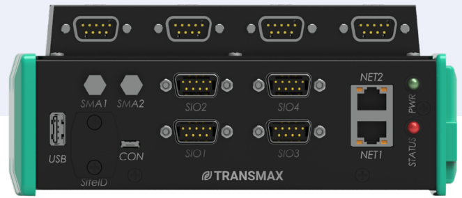
FP.VT-04 *8-port option with expansion module FP positioned vertically in the field